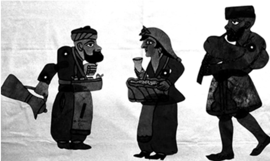
FIGURE 5. Two people peddling wares and a bagpiper represent the lower class origins of the art.

Karagöz , until the end of the nineteenth century, was a politicized and sexually explicit genre that represented the voice of the