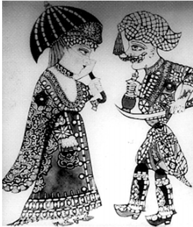
FIGURE 4. Traditional characters included the female Zenne and Matiz.