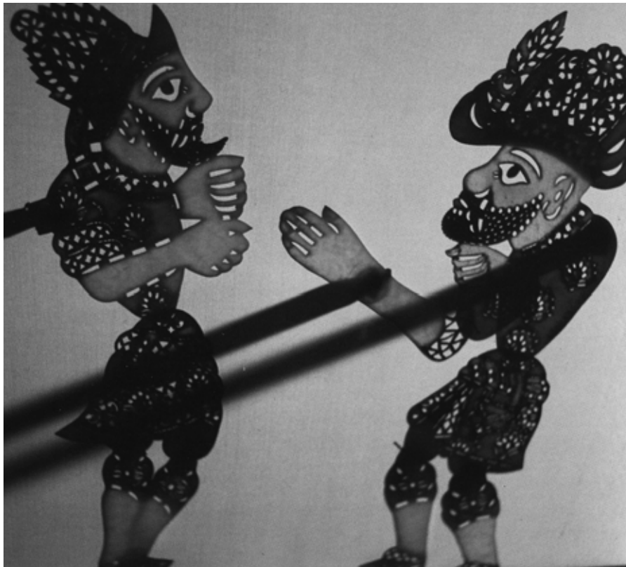
FIGURE 2. Hacivat and Karagöz are the major characters in the traditional shadow theatre. Karagöz represents the voice of the common man, while Hacivat, who represents higher class ideas, is often mocked.

In Turkey, a country governed by an absolute monarchy and a totalitarian regime, Karagöz is a character who never deceives himself or is soothed into a sense of security by shutting his eyes to the ills surrounding him. On the contrary, a karagöz show is a risqué-revue, as