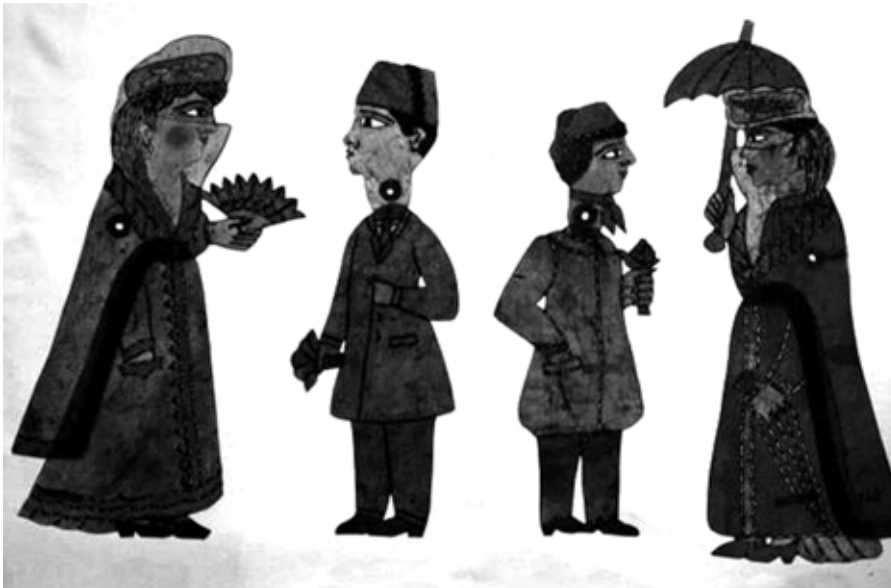
FIGURE 3. As part of modernization, the fez of the Çelebi (Womanizer) and the veil of the Zenne (Female) were replaced with more modern dress.

On the pretext of karagöz ’s modernization, attempts were made to transform it into a top-down enterprise. For instance, in 1933 Mustafa Rahmi (Balaban) 4 founded Association of Friends of Karagöz (Karagöz Dostları Derneği) to modernize karagöz for the benefit of the new state. Karagöz , according to Association Chairman Rahmi, could “increase individual enterprise”: “For example, Karagöz is unemployed. He is occupied with washing laundry. Hacivat deals with find-